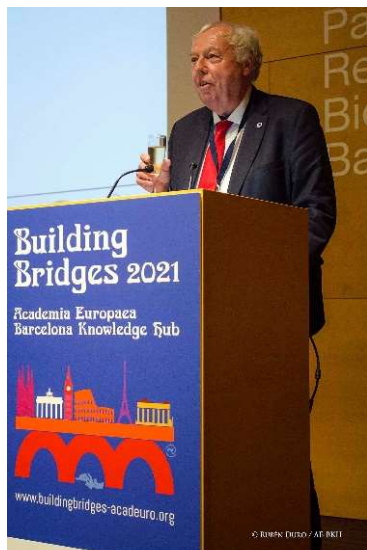
AE President Sierd Cloetingh during the closing of BB2021 at the PRBB.

AE-BKH is pleased to have hosted the AE 32nd Annual Conference and the 10th of the Young Academy of Europe (YAE), Building Bridges 2021 , bringing together a total of 329 experts (55 on-site delegates and 274 virtual delegates) representing 41 different countries and a wide variety of academic disciplines. Following the cancellation of the 2020 conference due to COVID-19, this year's conference took place in a new hybrid format featuring activities conducted on-site at the Barcelona Biomedical Research Park (PRBB) and online. Furthermore, the event marked the last annual conference for AE President Sierd Cloetingh (Utrecht University), who steps down at the end of 2021 after leading the academy for seven years.