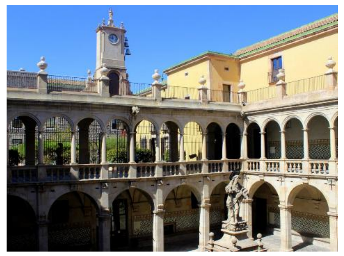
Cloister of the Institut d'Estudis Catalans, where the office is located

English has been adopted as the official language of the BKH, and therefore it is the language of all events organized by the BKH, though the BKH may also take part or collaborate in the organisation of events in other languages.